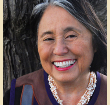
Jean Shinoda Bolen, MD